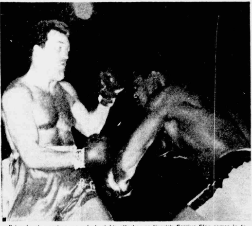
Brian London casts a wary look at his attacker as tigerish Cassius Clay comes in to him in the third round.

It was what must be Clay's first appearance in Britain. There can be no one left with a hope of fighting him unless some good seats sold well and he dropped for the count, beaten inconspicuously in seven minutes 40 seconds in one-sided fighting time.